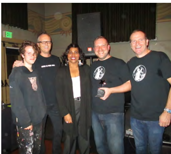
Habeas Corpse - Best Oregon Lawyer Band 2013